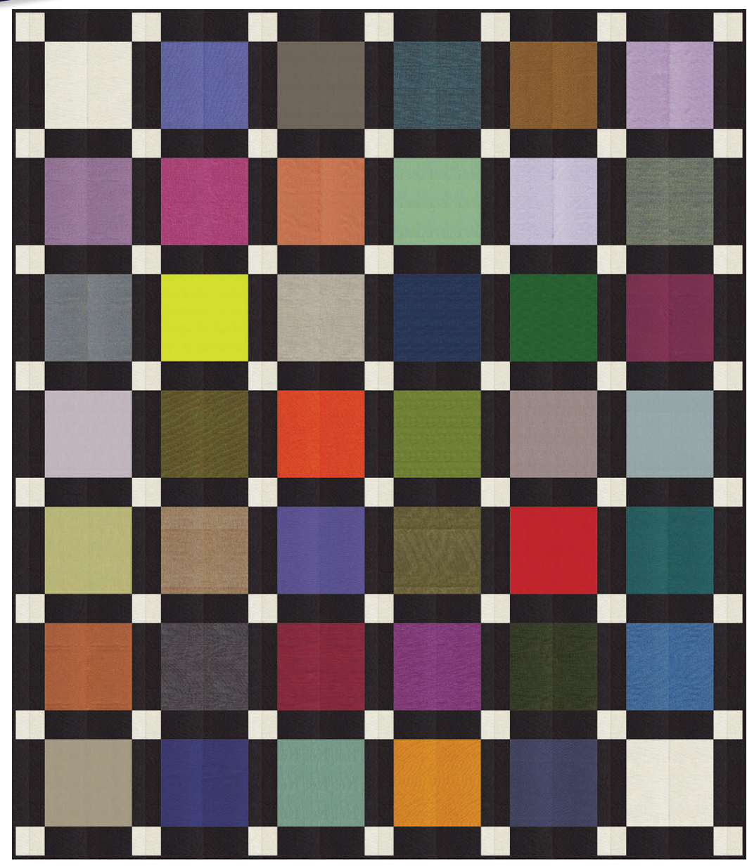
Finished Quilt Size 75" x 87"